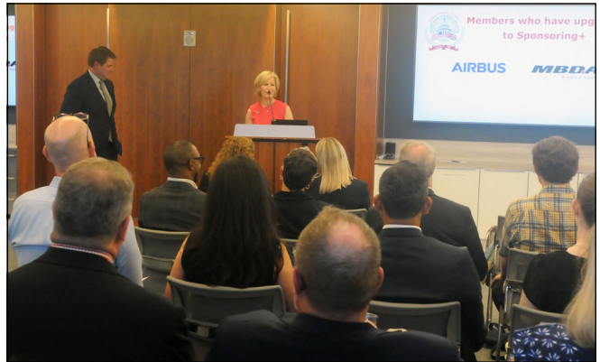
Annual General Meeting proceedings