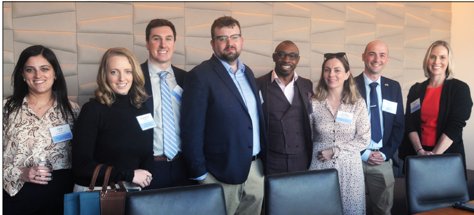
Meet the BABA Co-chairs