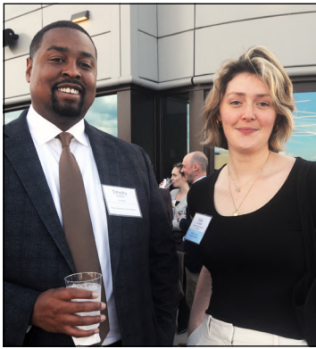
On page 7 May Spring Fling